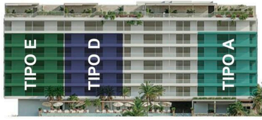
UBICACIÓN EN FACHADA

Superficie interior _____ 160.59 m 2 Superficie terraza _____ 51.18 m 2 Superficie total _____ 211.77 m 2 # Cajones _____ 2